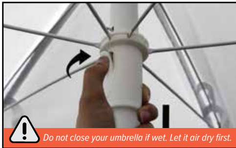
Step 1 To close, push the button on the hub & let it come down.