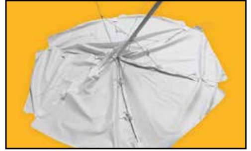
Step 3 Find a clean & open area to spread your Umbrella fabric & frame.