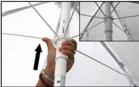
Step 1 *Make sure that the area around is clear from anything or anyone. Failure to do so may result in damage to your umbrella or injury to someone. Grasp the hub & push up to lock in place.