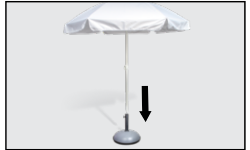
Step 6 Insert your Umbrella into any soft surface or into your selected base.