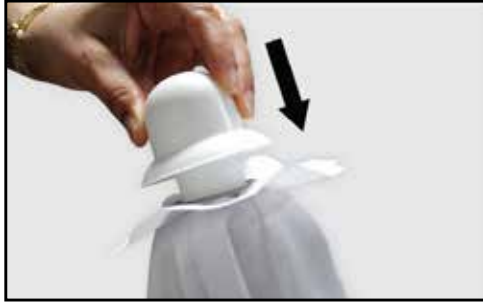
Step 2 Place the cap onto the top & push it in until it locks in place.