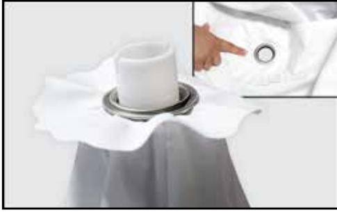
Step 1 Begin by inserting the Umbrella's frame into the fabric.