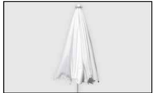
Step 2 Your Umbrella is now closed & you're all set to go.