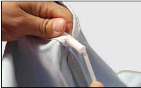
Step 4 Insert the ribs into the caps located on all corners of the Umbrella's fabric. Repeat this step for all your ribs.