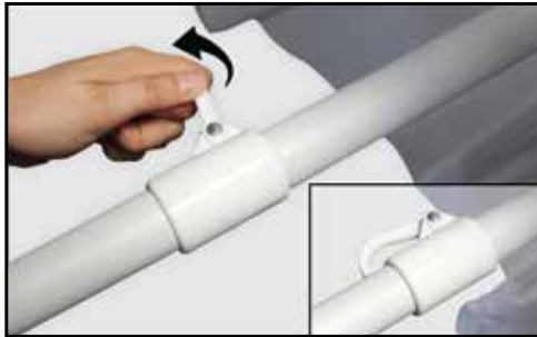
Step 5 Grab your frame & slowly bring it back up. Then, insert your bottom pole into the main pole of your Umbrella frame & lock it in place.